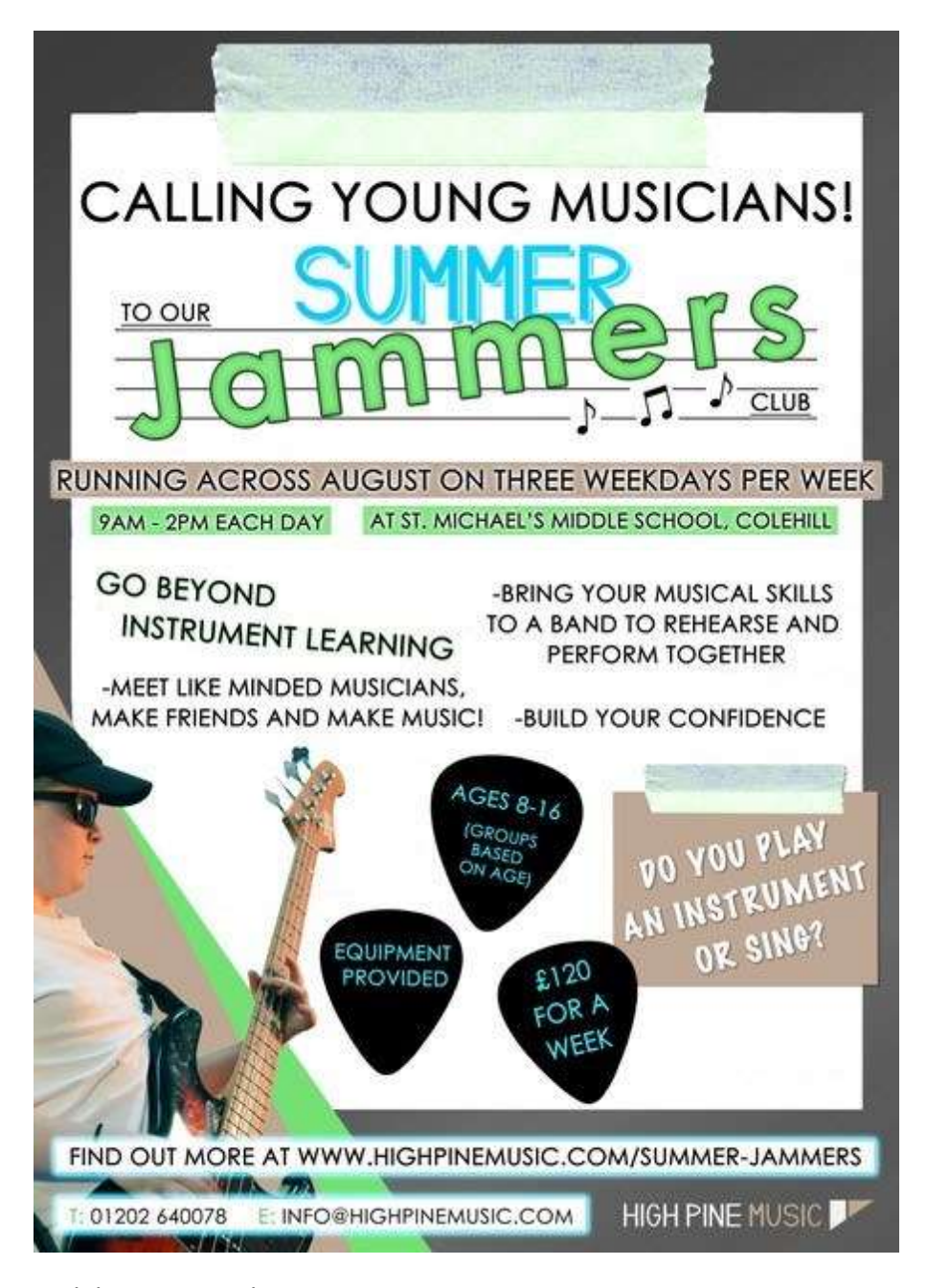
9am - 2pm, three weekdays per week in August.

DMH East Dorset Area Leader - Pete Whitmarsh: <a href="mailto:peter.whitmarsh@dorsetcouncil.gov.uk">peter.whitmarsh@dorsetcouncil.gov.uk</a>